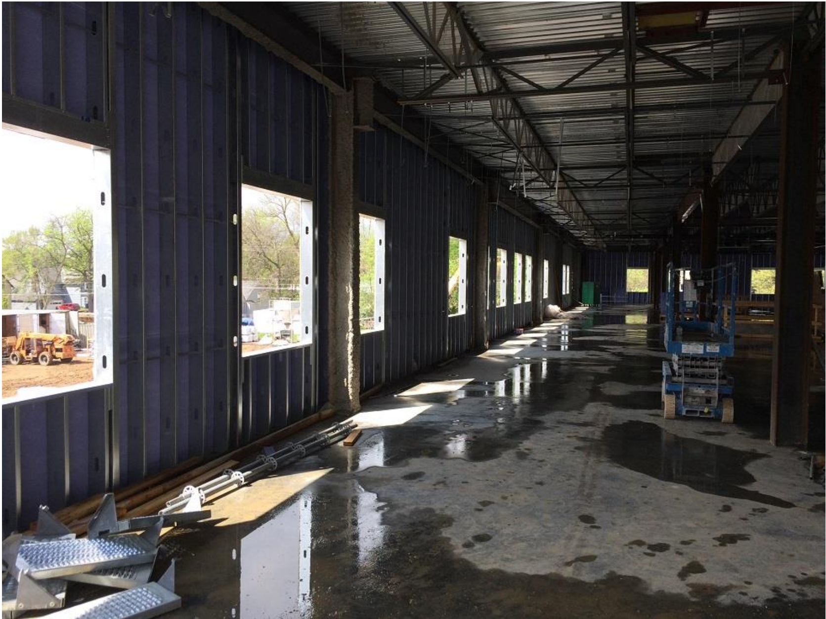
Exterior wall framing 3 rd level