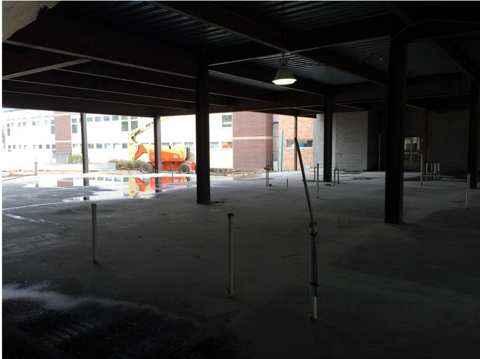
1 st floor slab on grade