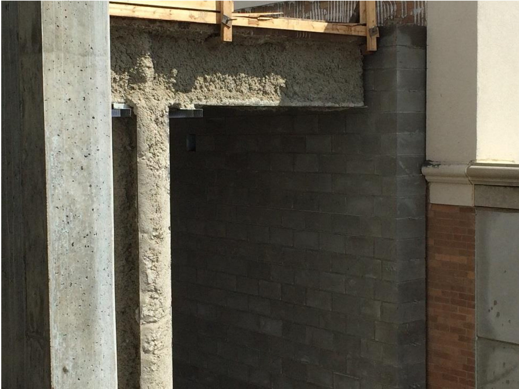
3 Hr Separation wall in place