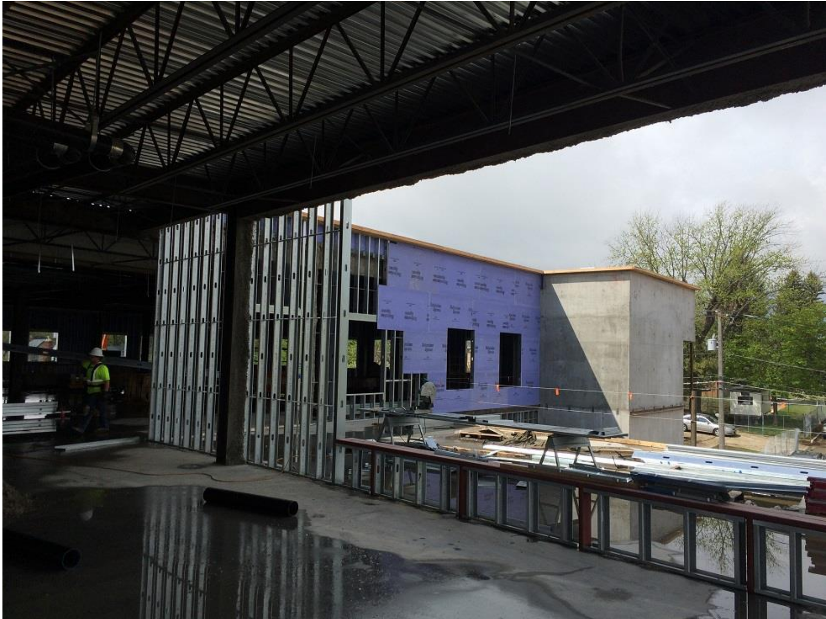
Exterior wall framing 3 rd level